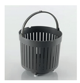
Basket for easy loading and unloading